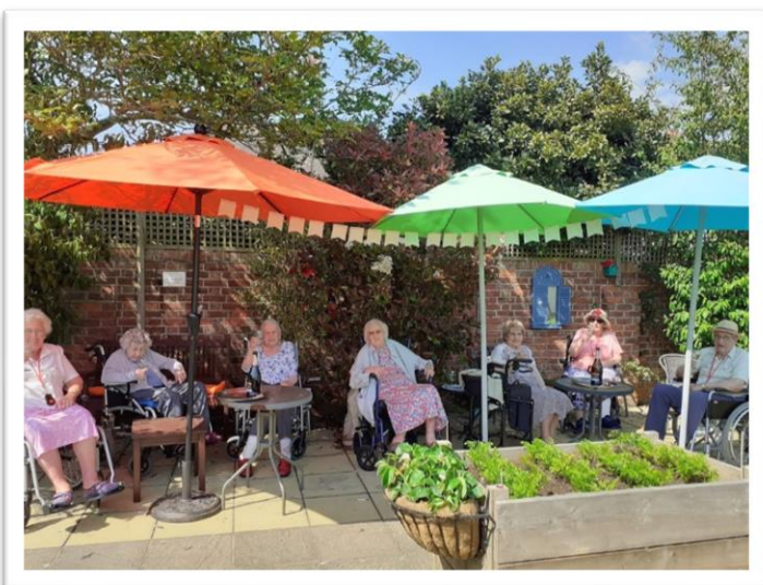
Italian Themed Day