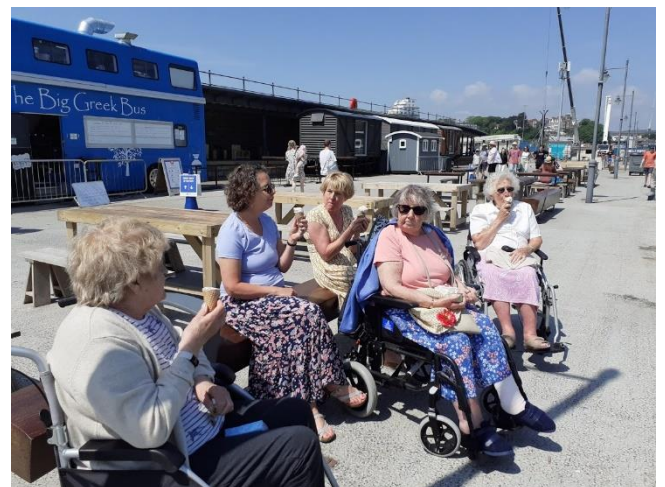
Outing to the Harbor Arm