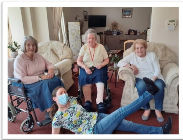
Jean's for Dementia Day