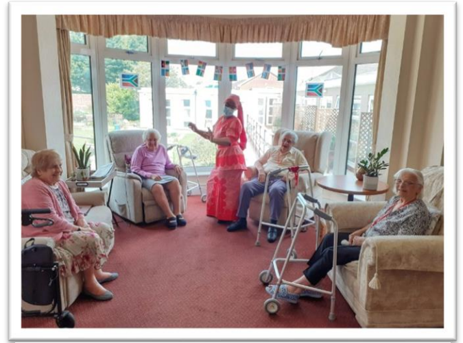
African Themed Day