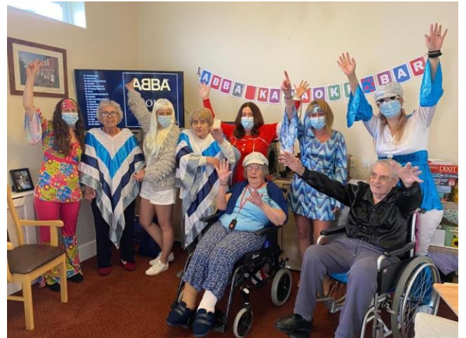
ABBA Themed Karaoke Bar