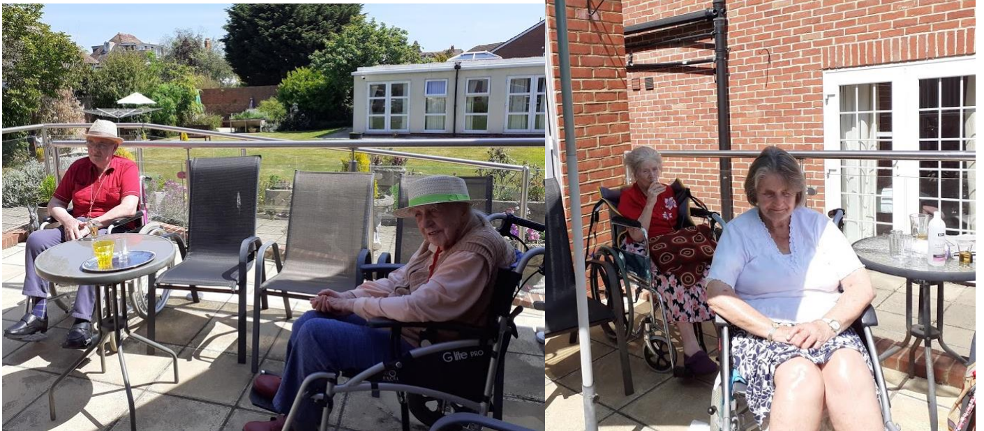
Relaxing on the patio in the sunshine